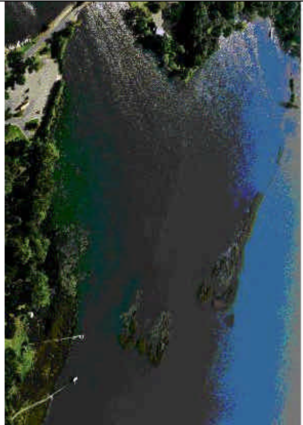
Matoska marsh in July 2002