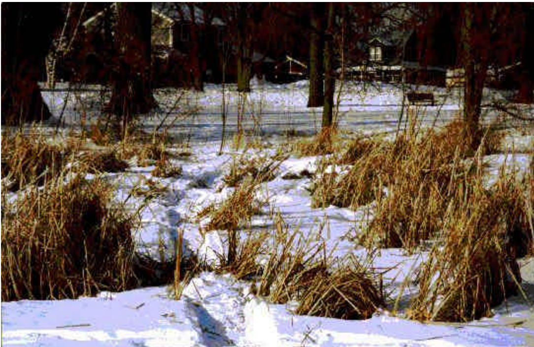
Snowmobiles going through the Matoska Marsh can damage emergent vegetation.

Department of Natural Resources (DNR) rules clearly state that it is illegal to remove emergent vegetation in Minnesota without a permit: "an APM [aquatic plant management] permit is required to... destroy emergent aquatic macrophytes 1 in public waters" (Minnesota Rule 6280.0250, Subpart 2, C). the penalty for such behavior is a misdemeanor (Minnesota Rule 6280.1200). By authority given by the State Legislature, DNR rules have the force and effect of law.