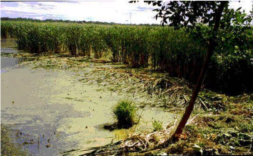
Healthy and damaged plants on the edge of a cattail stand in Matoska Marsh.